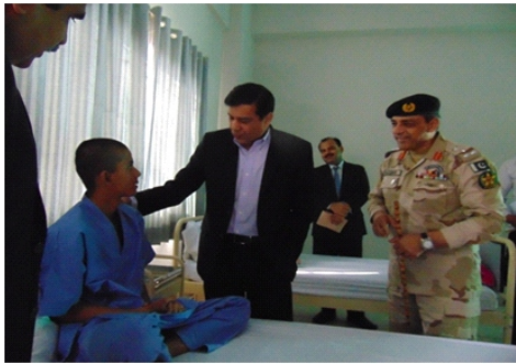
Director General (The than) ANF visit to MATRC Karachi - 6 Feb 2017