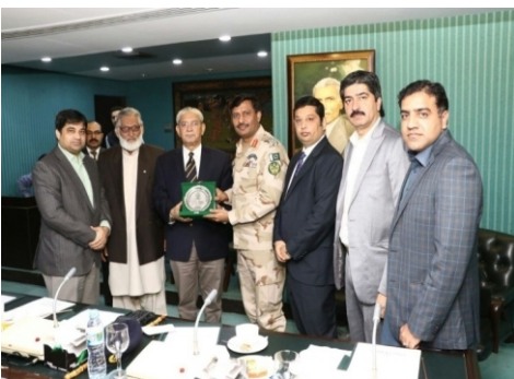
Force Commander Regional Directorate ANF Punjab visited Chamber of Commerce & Industry - 07 Mar 2017