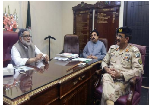
Awareness Session with Chamber of Commerce - 07 Mar 2017