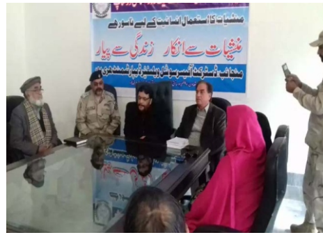
Anti Drug Workshop at District Social Welfare Department Haripur 17 Jan 2017