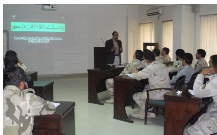
Drugs & Precursors Identification Course from 20 to 24 Mar 2017 (Completed)