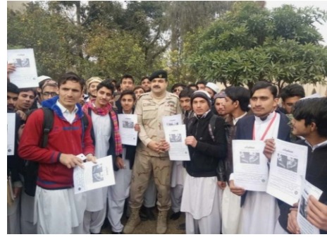
Distribution of Anti Drug Awareness material / leaflets at Govt Boys Degree College Nowshera - 17 Jan 2017