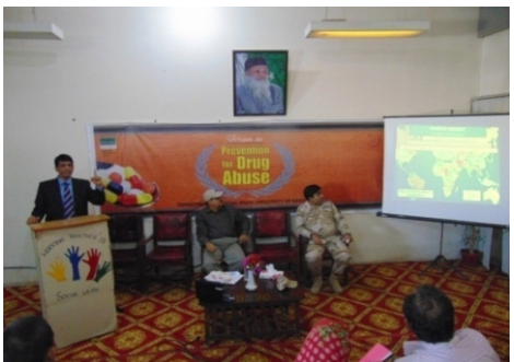
Awareness Lecture at University of Karachi 31 Mar 2017