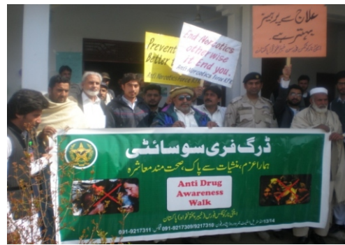
Anti Drug Awareness Walk at Swabi - 09 Mar 2017