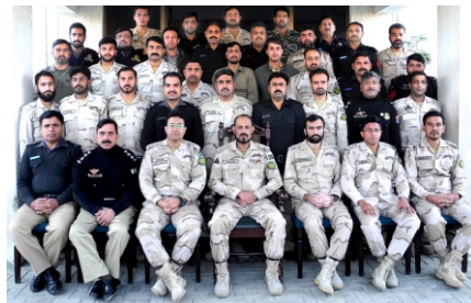
Handling of Informant & Information Gathering Course from 02 to 13 Jan 2017 (Completed)