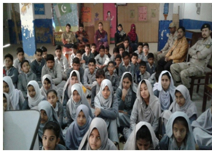
Awareness Lecture at Apwa Rana High School Hyderabad – 25 Jan 2017