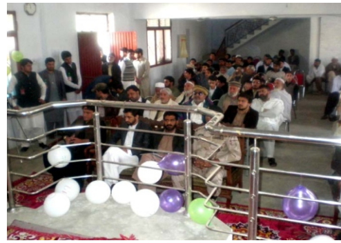
Anti Drug Awareness Lecture at Swabi - 09 Mar 2017