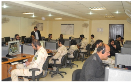
Computer Based Training from 30 Jan to 03 Feb 2017 (Completed)