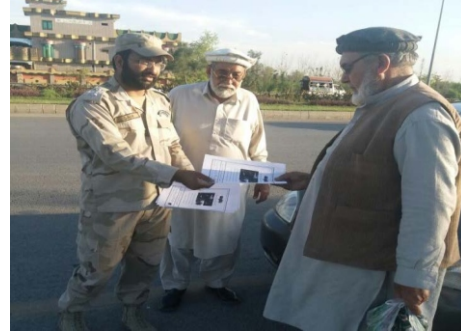
Distribution of Awareness Material / Leaflets at Motorway Peshawar 29 Mar 2017