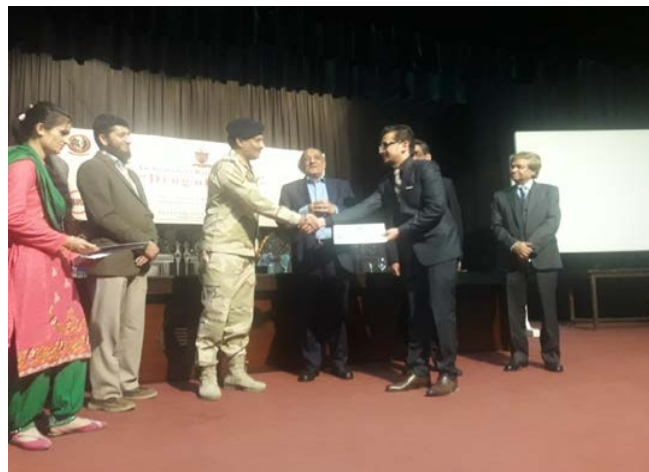
Awareness Seminar at Regional Directorate ANF Punjab- 15 Feb 2017