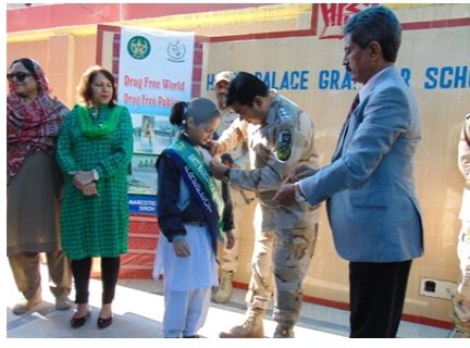
Awareness Lecture at Happy Place School Karachi – 24 Jan 2017