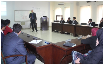
Training on Assets Investigation organized by UNODC from 07 to 09 Feb 2017 (Completed)