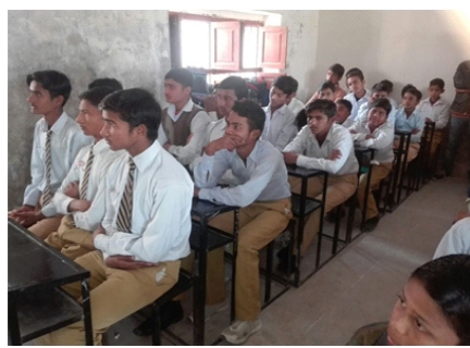
Awareness Lecture at Allama Iqbal High School Hyderabad – 30 Jan 2017