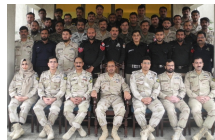
Surveillance Course from 16 to 27 Jan 2017 (Completed)