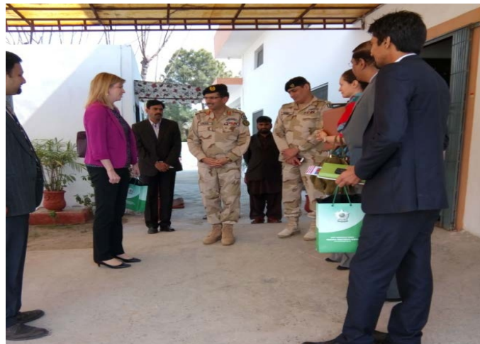
INL P Delegation visit to MATRC (Hospital of ANF for Drug Addicts) at Islamabad 10 Mar 2017