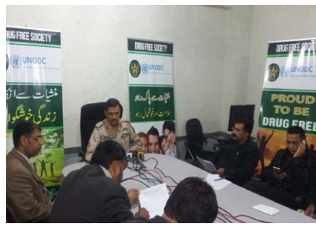
Media Briefing on Mega Seizure - 6 Jan 2017