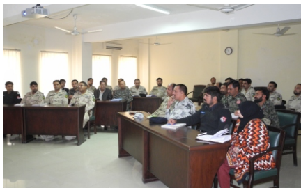
Gathering of Information & Analysis Course from 20 Feb to 03 Mar 2017 (Completed)