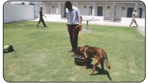
UNODC delegation visited Headquarters ANF on 25 May 2017 and observed ANF Dogs Training & Breeding Center