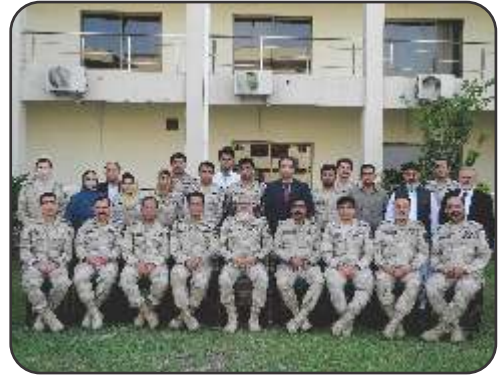
Anti Money Laundering Seminar held from 24 to 27 April 2017