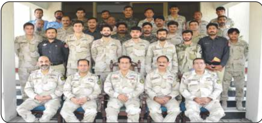
Computer Based Training held from 22 to 26 May 2017