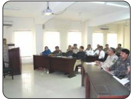
Interview & Interrogation Course held from 24 to 28 April 2017