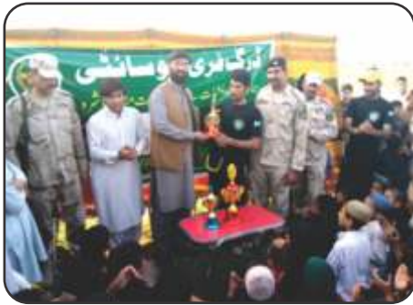
ANF Cricket Tournament, Peshawar 10 April 2017