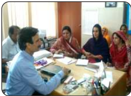
Awareness Session with Focal Persons at Ghari Shahu, Lahore - 05 June 2017