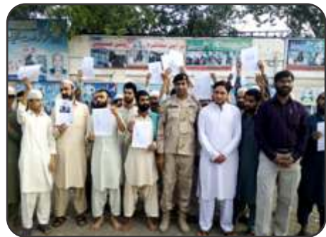
Distribution of Awareness Material at Da Haq Awaz Drug Treatment Center, Peshawar - 21 June 2017