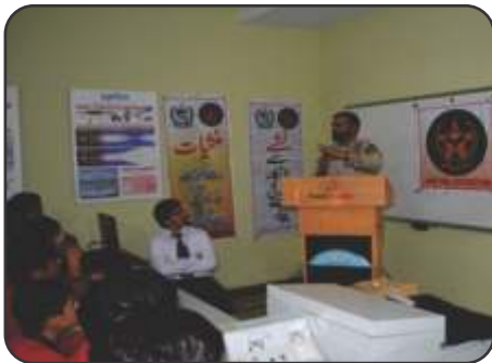
Awareness Lecture at Pak Turk School, Quetta – 04 May 2017