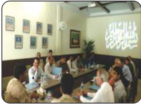
Meeting with Educational Institution at RD Lahore - 10 May 2017