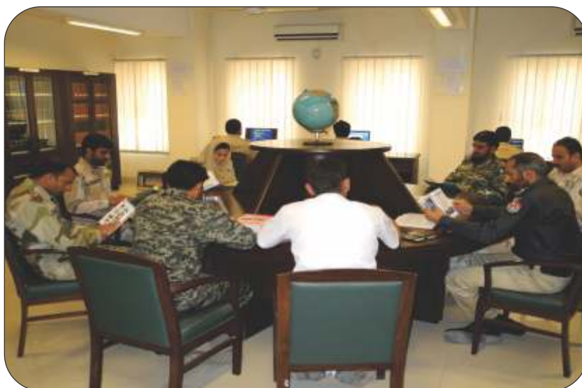
Law Course held from 03 to 14 April 2017