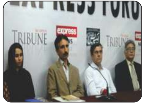
Awareness through Media at Express Chanel, Lahore - 19 June 2017