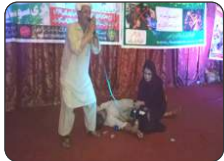
ANF Cultural-cum-Musical Show at Haripur - 27 & 28 June 2017