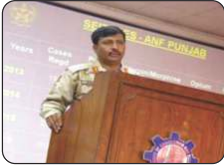
Awareness Lecture at University of Engineering and Technology, Lahore - 12 April 2017