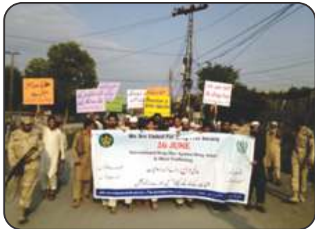
Awareness Walk at Da Haq Awaz Drug Treatment Center, Peshawar - 21 June 2017