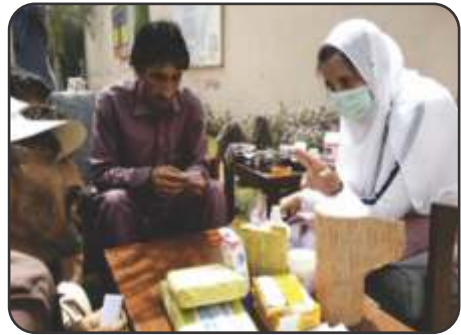
Free Medical Camp, Peshawar 21 April 2017