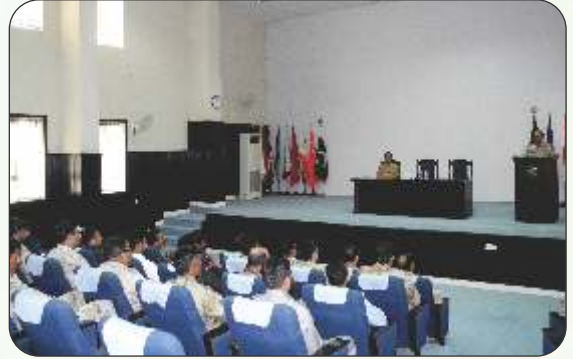
Drug Law Enforcement Course (Upper Rank) from 07 to 31 Aug 2017