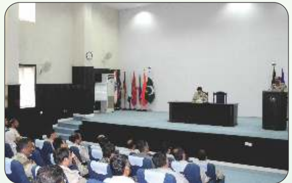
Interview & Interrogation Course from 11-22 Sep 2017