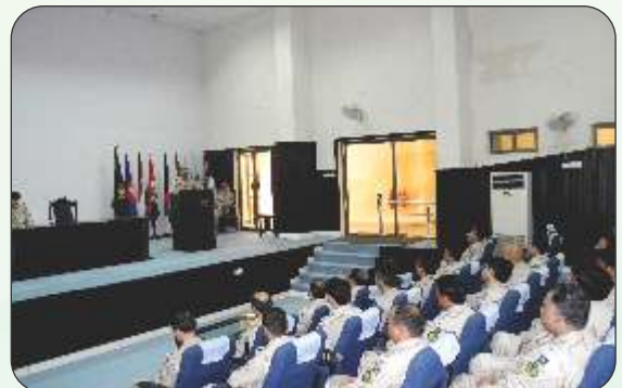
Orientation Workshop from 05 to 06 Jul 2017