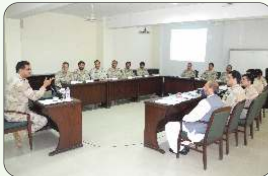
Drug & Precursor Identification Course (Lower Rank) from 03 to 07 Jul 2017