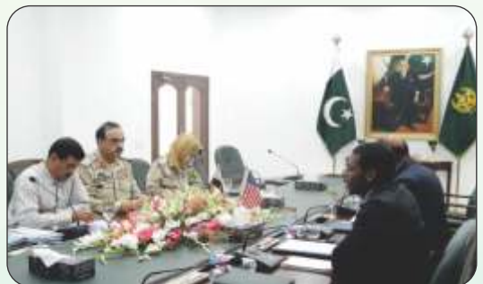
UNODC and Japanese delegation handed over hand held Analyzers to ANF on 03 Aug 2017:-