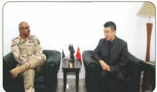
Chinese Drug Liaison Officer visited ANF Headquarters on 14 Sep 2017