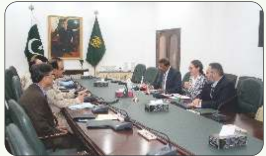
INL-P/DEA delegation comprising following members visited HQ ANF on 07 Sep 2017:-