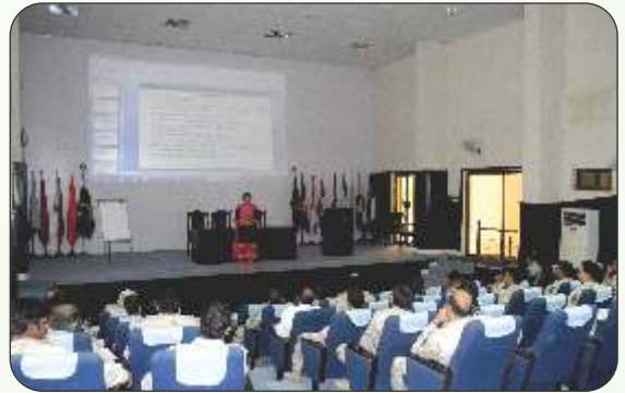
Seminar on Money Laundering from 28-31 Aug 17