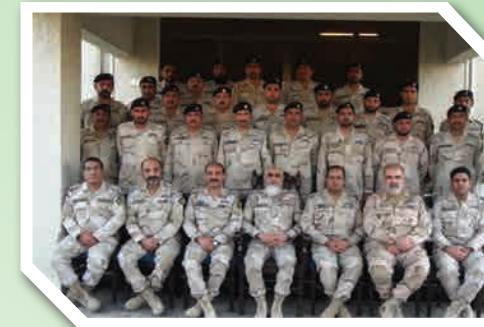
Basic Drug Law Enforcement Course-I