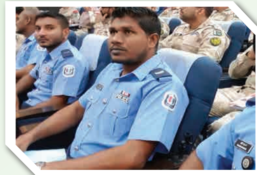
Training to officers of International Law Enforcement Agencies

(1) Federal Minister for Narcotics Control On 02 Nov 2017, Federal Minister for Narcotics Control Lt Gen (Rtd) Salauddin Tirmizi, HI (M), S Bt & T Bt visited ANF Academy, Islamabad. Briefing on roles and functions was given by the Commandant of Academy. Honourable Minister also observed various training facilities during his visit.