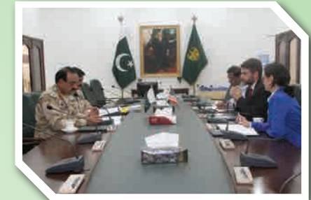
Following INL-P delegation visited HQ ANF on 07 Nov 2017:-