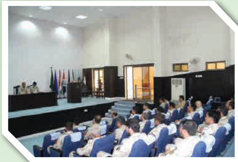
Advance Drug Law Enforcement Course