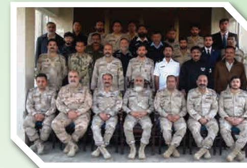
Anti Money Laundering Course