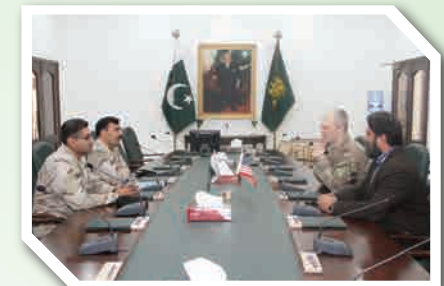
Following ODRP delegation visited HQ ANF on 06 December 2017:-