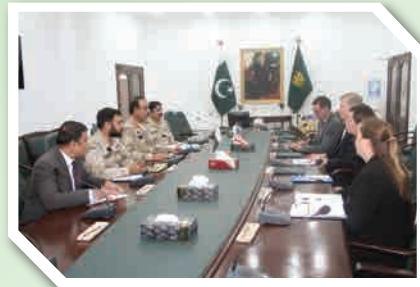
INL-P delegation comprising the following visited HQ ANF on 31 October 2017:-