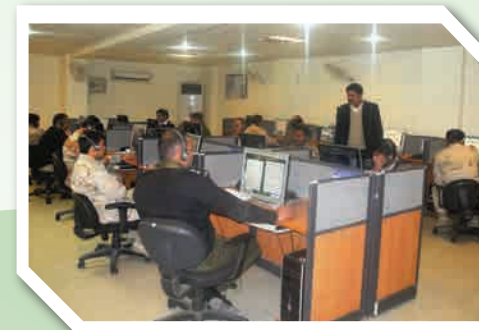
Computer Based Training (CBT)