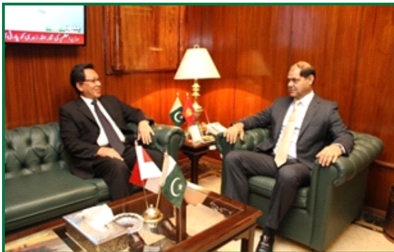
Mr. Muhammad Burhan, Ambassador of the Republic of Indonesia - 9 April 2015