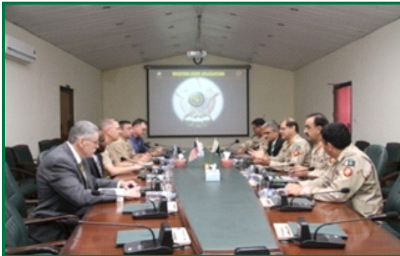
ODRP delegation led by Rear Admiral Douglas G. Morton, Deputy for Security Cooperation / ODRP - 2 Apr 2015.