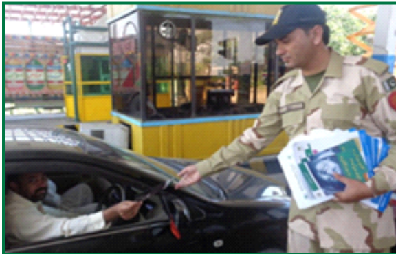
Awareness Through Published Material - 26th June