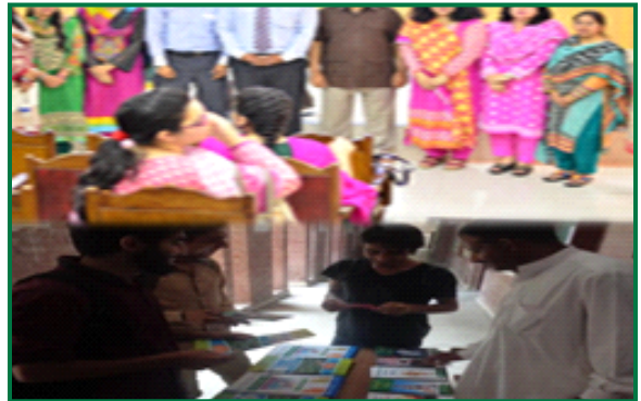
Awareness Stall & Participation in Seminar at GCU Lahore – 16th June