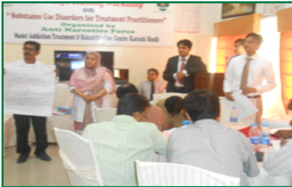
2 - Days Training Workshop organized in MATRC Karachi