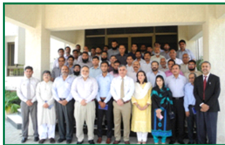
Training Industries Representing on Precursors (UNODC Sponsored) 8 to 11 June (two sessions each of 2 days)