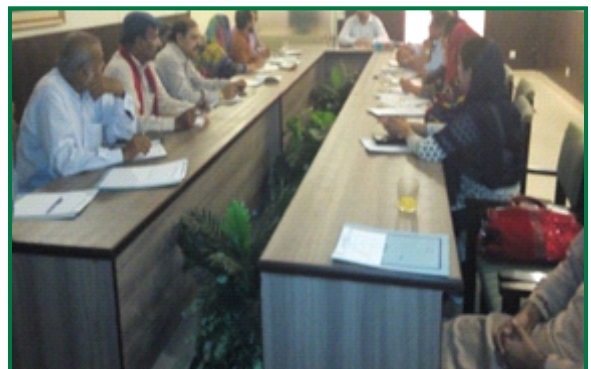
NGOs Workshop held at RD ANF Punjab - 18th June