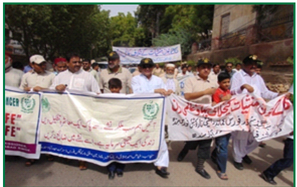
Walk organized at Hyderabad - 26th June