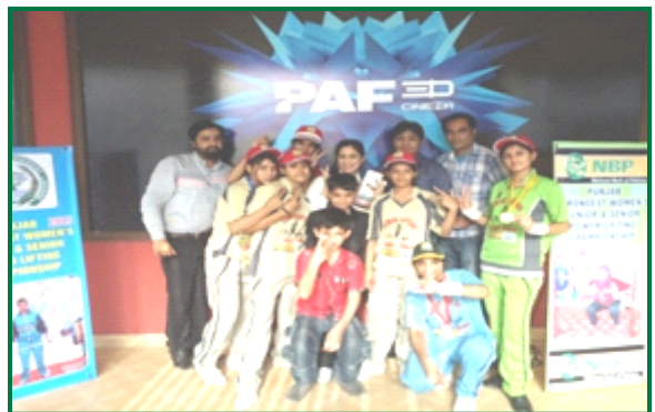
Sports Competition at PAF cinema, Lahore - 21st May