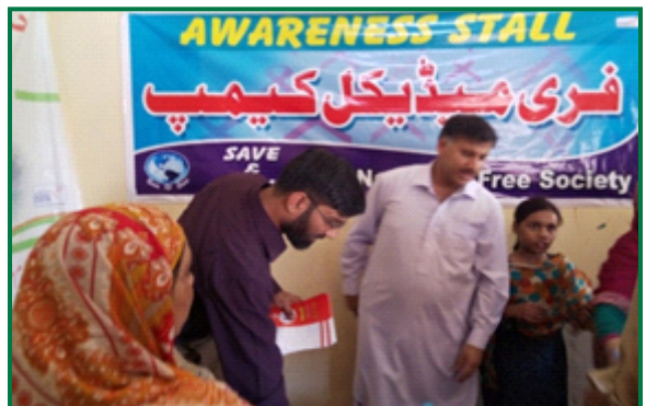
Awareness Stall and Free Medical Camp - 11th June