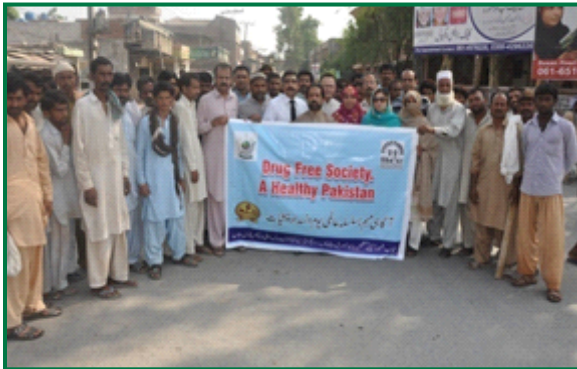
Walk at Social Complex Multan - 25th June