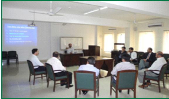
Orientation Training of Newly Posted Army Officers 13 to 24 Apr 2015