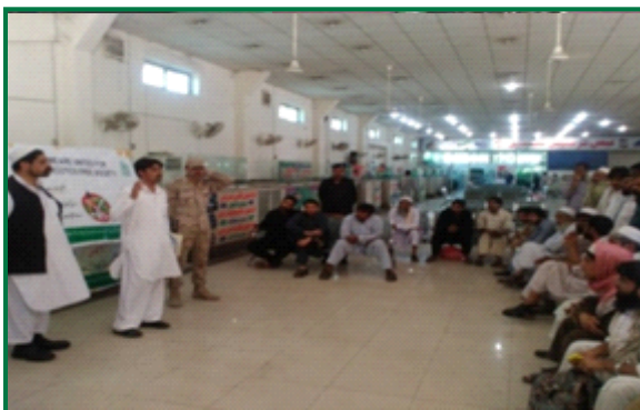
Awareness Stall at Peshawar Bus Terminal - 26th May