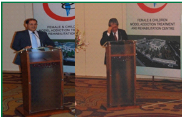
Donor conference at Movenpick Hotel, Ball Room-A, Karachi - 15th June