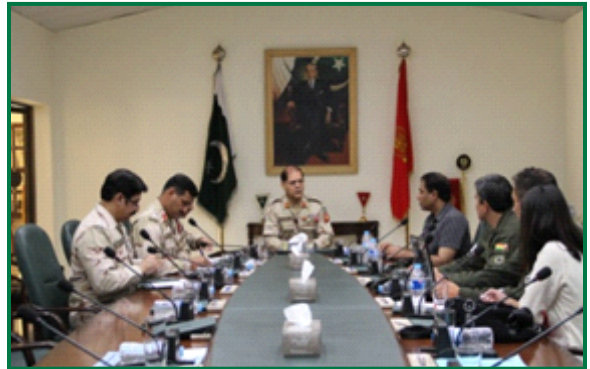
Bolivion Dog Master Trainer Team 22 May 2015