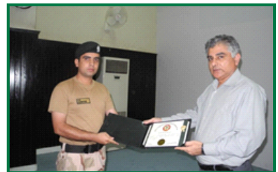
Narcotics Law Enforcement Course – 1 (NLEC-1) for ASIs 18 May to 26 June 2015