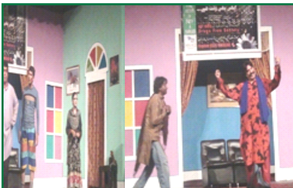
Stage Play at Alhamra Cultural Complex Qaddafi Stadium, Lahore - 15th June