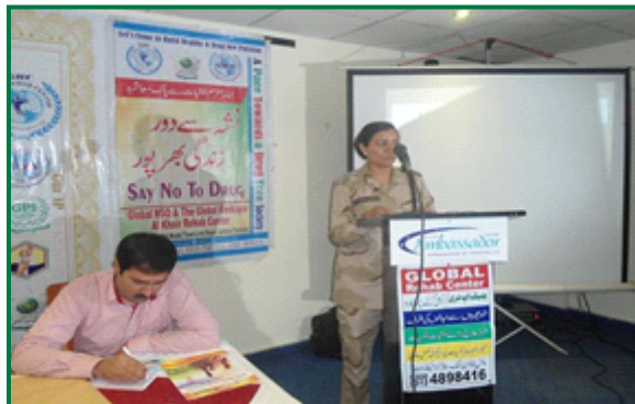
Training Workshop at Ambassaber Hotel, Lahore - 25th Apr