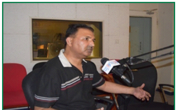
Awareness Program (Live) on FM Radio Power 99 - 20th May