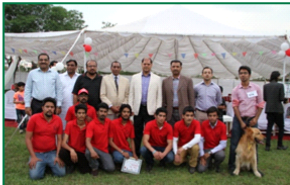
Dog & Pet Gala - 5th Apr