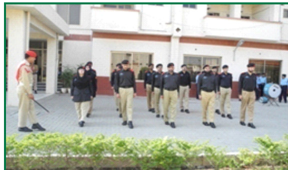
Training Activities – Basic Training ADs / Inspis 5 Jan to 3 Jul 2015