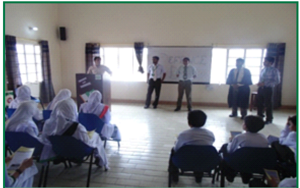
Lecture at Govt Boys High School Lyari Quarters - 9th June