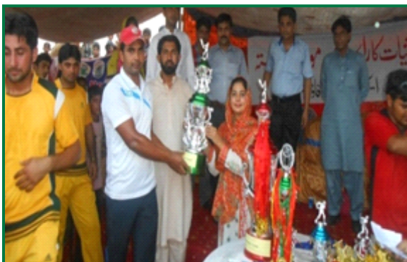
Sports Competition at Sialkot Sprts Complex, Sialkot - 26th June