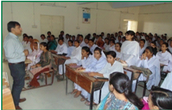
Lecture at Govt. Girls High School, Lyari - 8th June