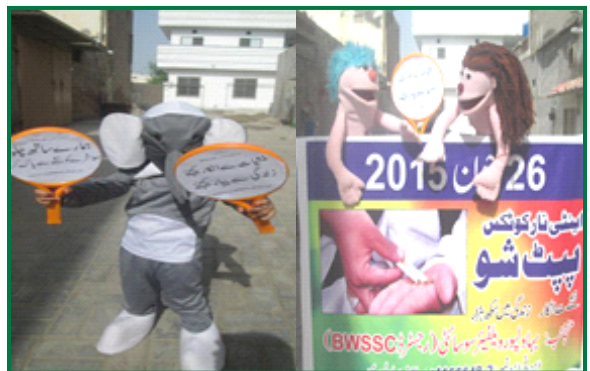
Puppet Show at Bahawalpur - 26th June