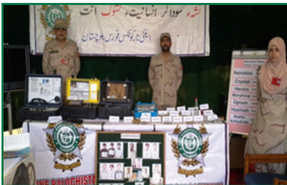
Awareness Stall organize at Govt. Girls Degree College - 20th June