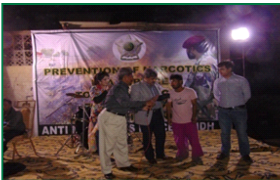
Musical Programme at Sea View, Karachi - 30th May