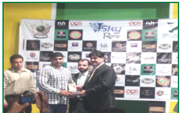
Award Show at Tamaseel Theatre - 12th June