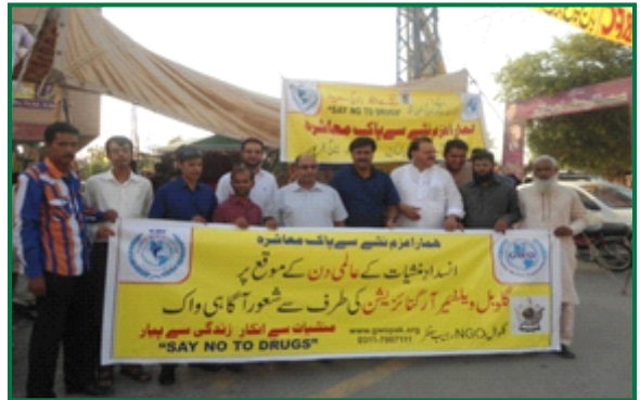
Walk held at Lahore - 26th June