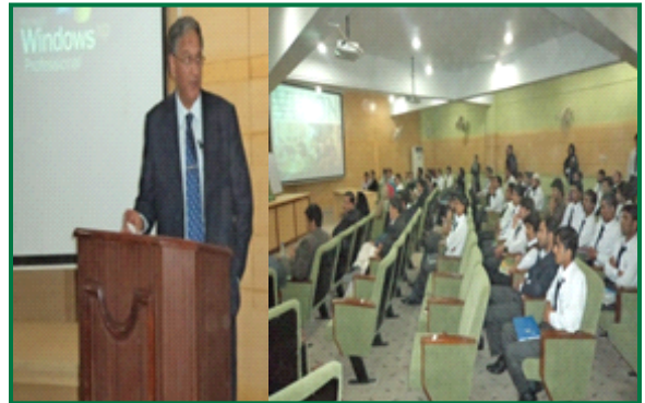
Seminar held at BUITMS Taku Campus, Quetta - 8th June