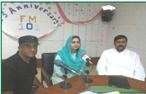
Awareness through FM Radio in Sialkot - 26th June