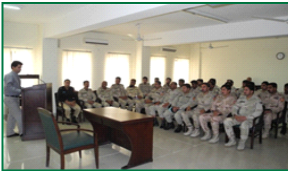
Narcotics Law Enforcement Course – 3 (NLEC-3) for Constables 18 May to 12 June 2015