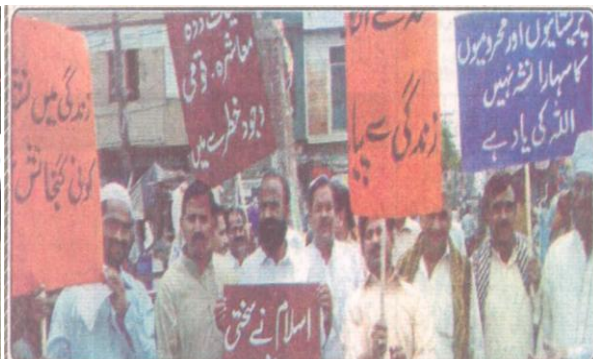
Walk at Nishtar Colony, Lahore - 26 th June