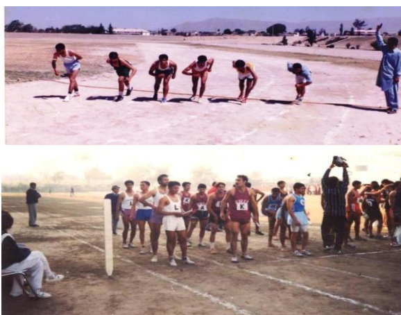
Athletic Match organized at Askari Park Airport Road, Quetta - 9 th June