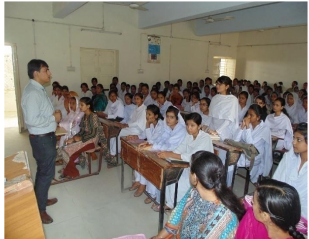
Lecture at Govt. Girls High School, Lyari - 8 th June