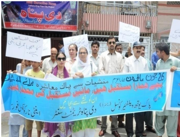
Walk at Riwarz Garden to MAO College Lahore - 13 th June