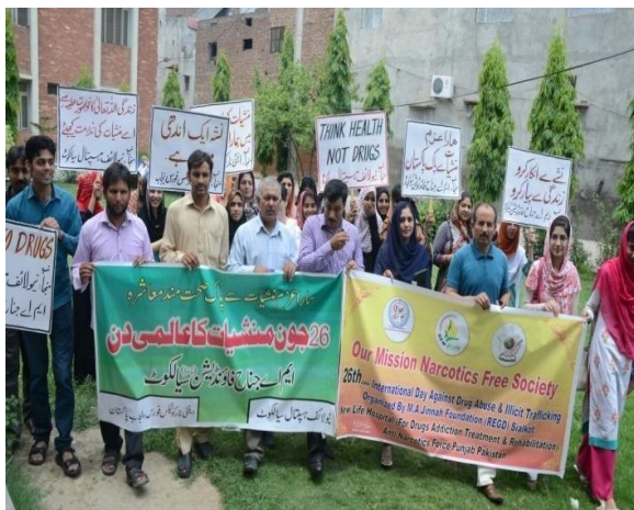
Walk organized at Sialkot - 25 th June