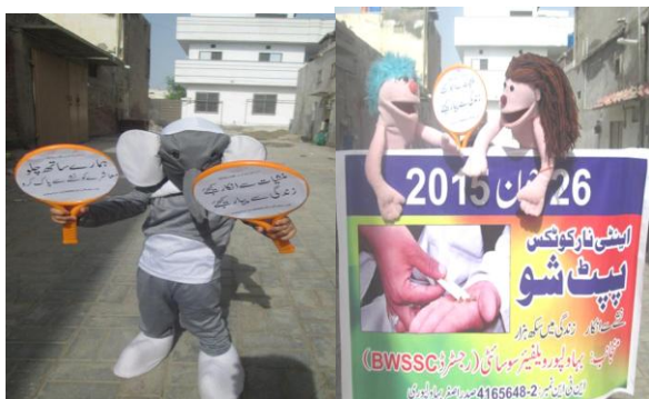
Pappet Show at Bahawalpur - 26 th June