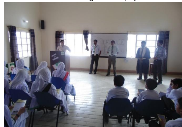
Lecture at Govt Boys High School Lyari Quarters - 9 th June