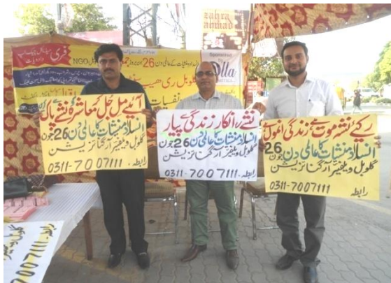
Free Medical and Awareness Camp at Lahore - 26 th June