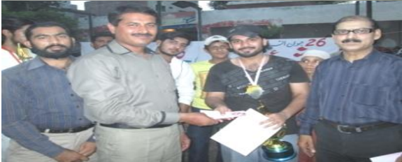
Cricket Tournament at Karson Ground Garhi Shaho, Lahore - 16 th June