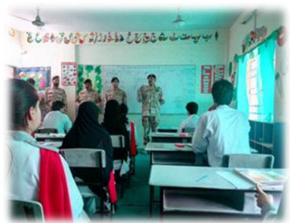
Lecture at "International Islamic University Islamabad School", Rawalpindi - 26 th June