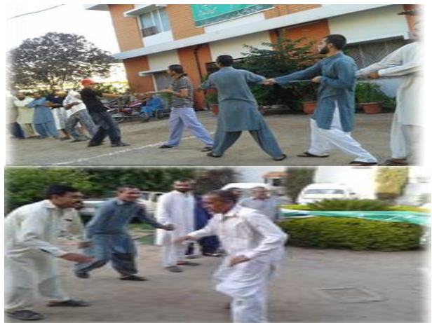
Conducted Tag of War & Kabadi Competition among MATReC Patients - 26 th June