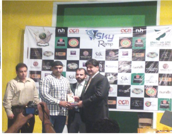
Award Show at Tamaseel Theatre - 12 th June