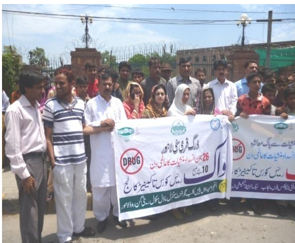
Walk at Race Course, Lahore - 26 th June