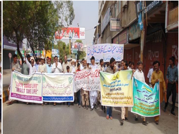
Walk organized at Hyderabad - 26 th June