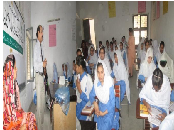
Lecture at Iqra Academy - 12 th June