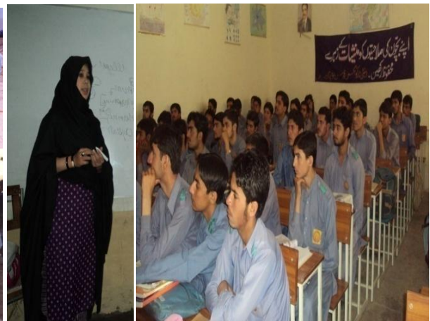
Lecture at Sardar Shafiq School, Quetta - 10 th June