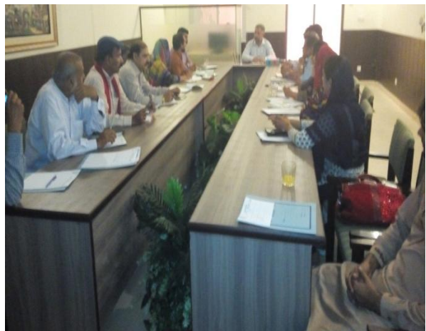
NGOs Workshop held at RD ANF Punjab - 18 th June