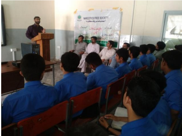
Lecture at Working Folks Model School & College Peshawar - 11 th June