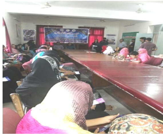
Seminar held at Sialkot - 25 th June