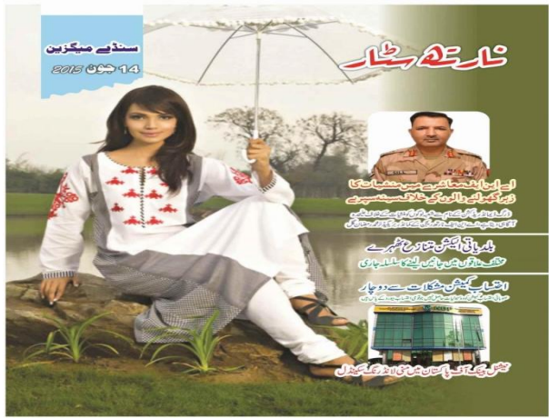
Awareness Thru Print Media - 14 th , 21 st & 28 th June