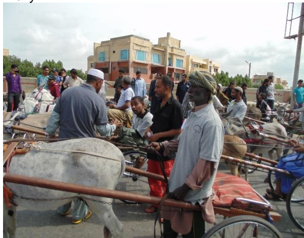
Donkey Cart Race Competition