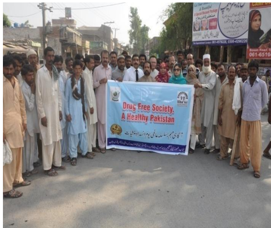
Walk at Social Complex Multan - 25 th June