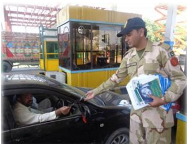
Awareness Through Published Material - 26 th June