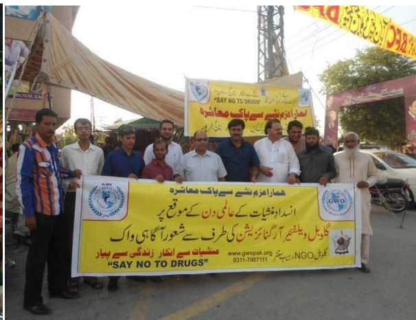
Walk held at Lahore - 26 th June