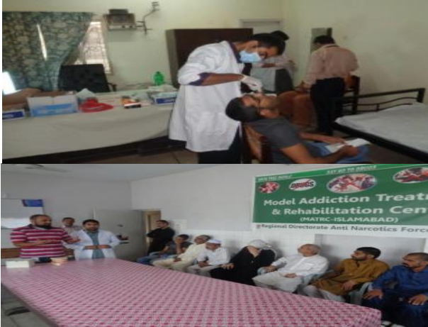
Dental Camp organized - 2 nd June