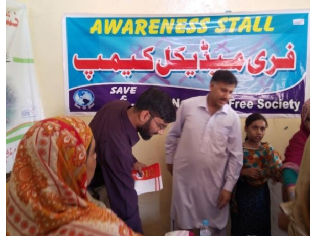
Awareness Stall and Free Medical Camp - 11 th June