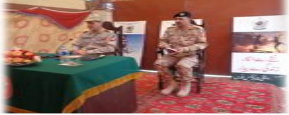
Annual Darbar held at RD North - 17 th June