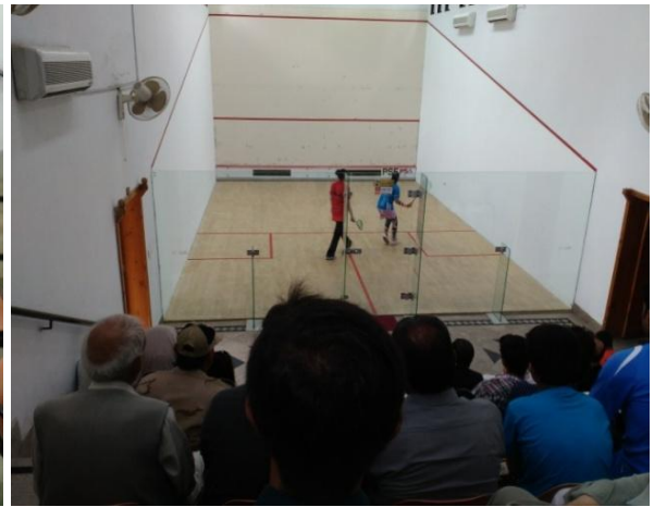
Women Squash Championship 13 th -16 th June