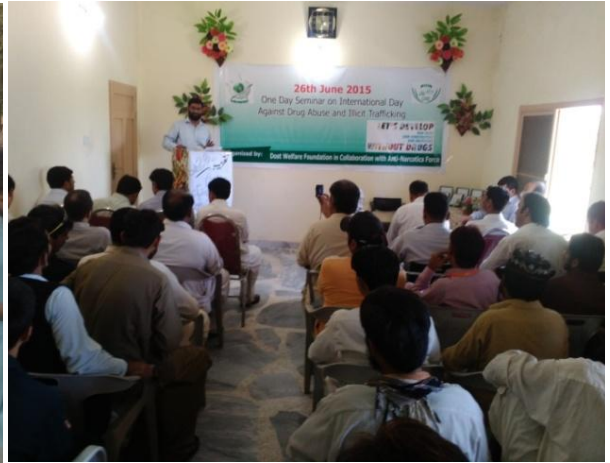
Seminar on Drug Demand Reduction at Peshawar - 26 th June