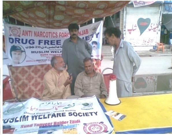
Stall at Qainchi Bus Stop, Lahore - 23 rd June