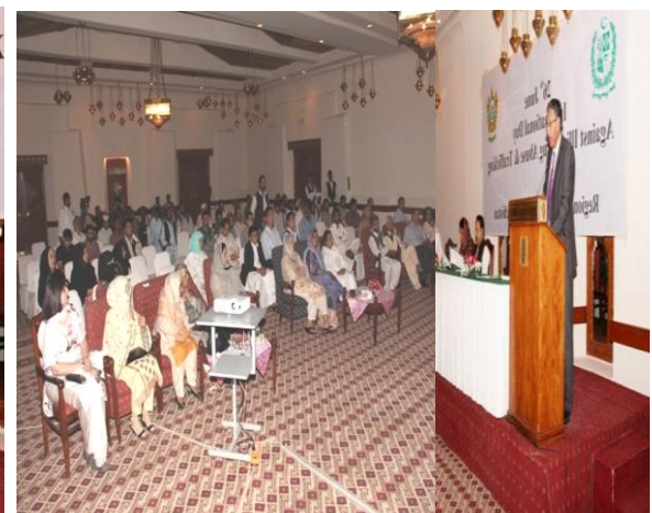
Seminar held at Serena Hote,l Quetta - 26 th June