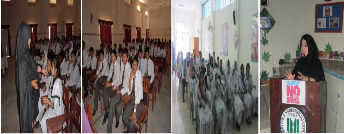
Lecture at APS Seven Stream Quetta Cantt - 2 nd June