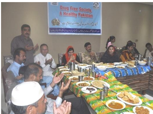
Seminar held at Multan - 26 th June