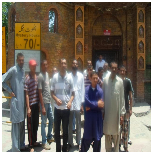
Recreational Trip for Patients of MATReC Islamabad to Ayub Park -16 th June