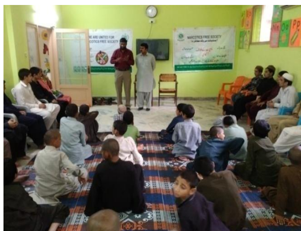
Lecture held at Dost Welfare Foundation, Peshawar - 10 th June