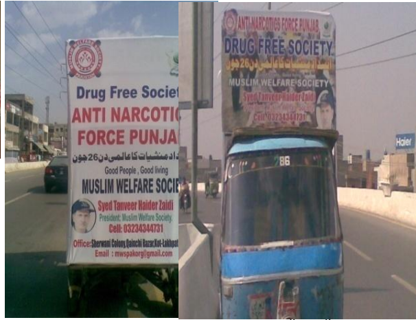
Rikshaw Campaign at Lahore - 25 th /26 th June