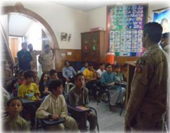
Lecture held at "Paxon School of Advance Education in at Rawalpindi - 25 th June