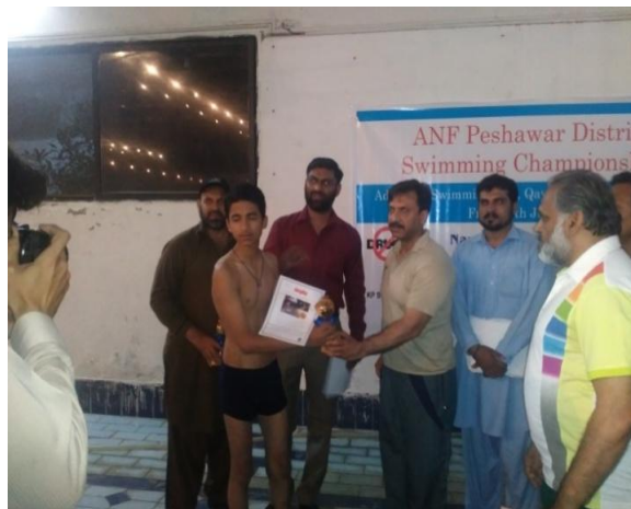
ANF Swimming & Table Tennis Tournament organized at Peshawar - 10 th June