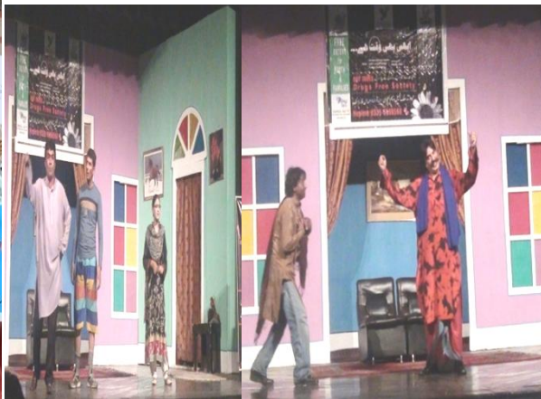
Stage Play at Alhamra Cultural Complex Qadaffi Stadium, Lahore - 15 th June