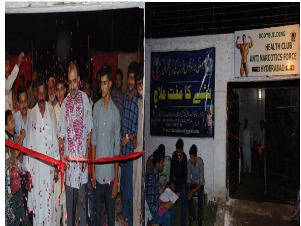
Establishment of Body Building Club Hussainabad Hyderabad - 26 th June