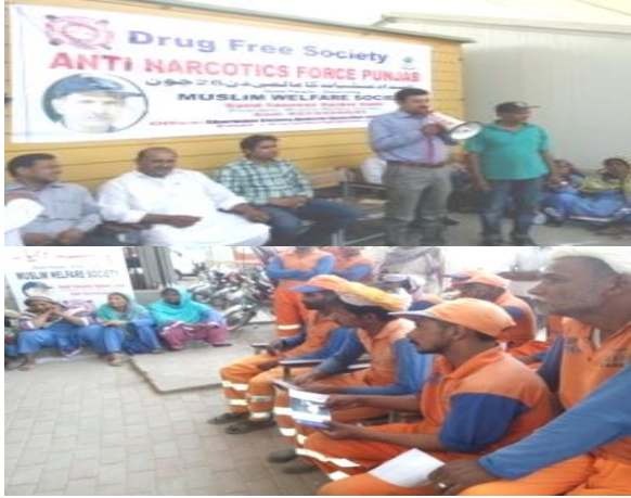
Lecture at Qainchi Bus Stop - 10 th June