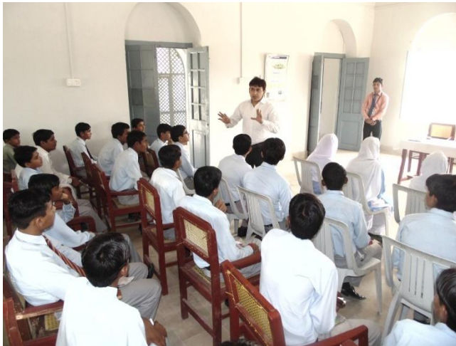
Lecture at Ghulam-e-Abbas School, Lyari - 8 th June