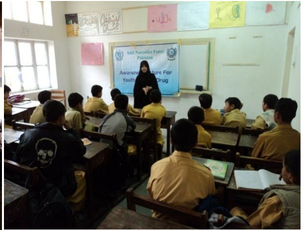
Lecture at Yezdan Khan High School at Gulistan Road, Quetta - 15 th June