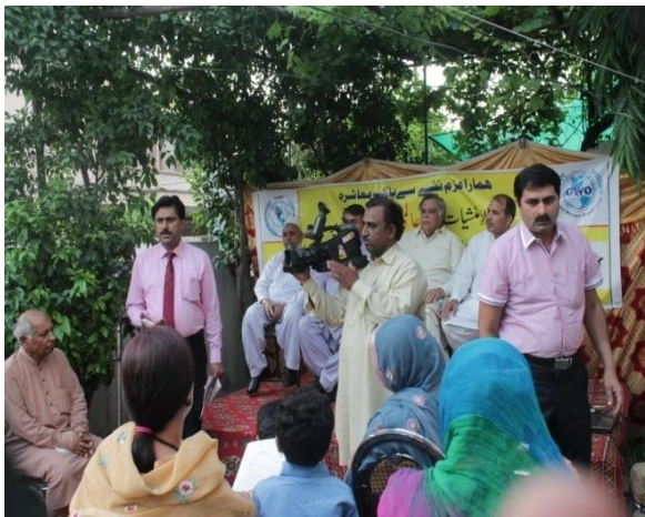
Seminar organized at Lahore - 26 th June