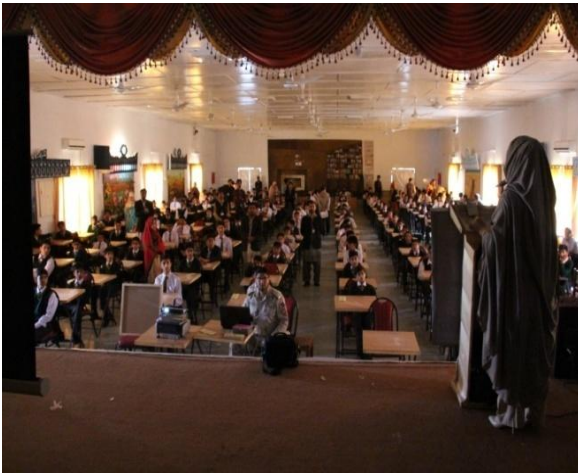
Lecture at Iqra APSACS, Quetta Cantt - 12 th June