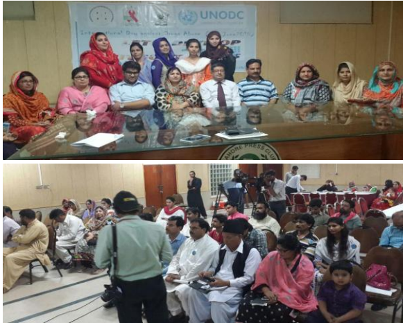
Seminar at Press Club - 25 th June