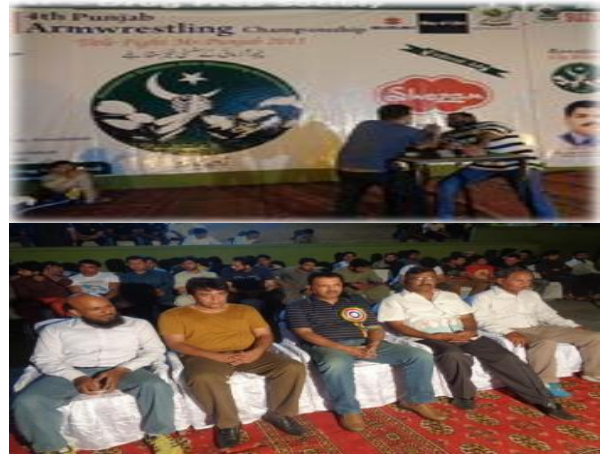
Arm Wrestling Competition held at Liaquat Bagh Sports Complex, Rawalpindi - 7 th June