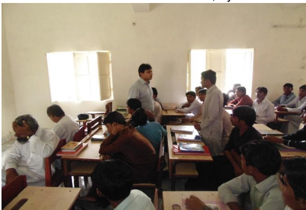
Lecture at Al-Karim Secondary School, Lyari - 9 th June