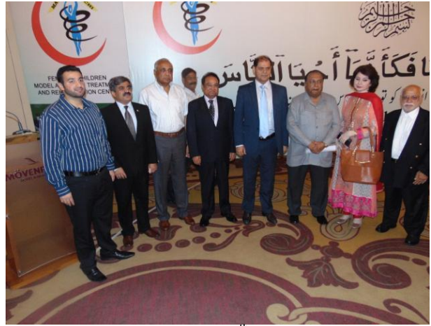
Donor conference at Movenpick Hotel, Ball Room-A, Karachi - 15 th June