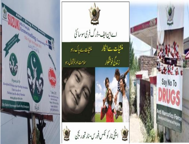
Awareness through Hoardings - 8 th , 14 th & 25 th June