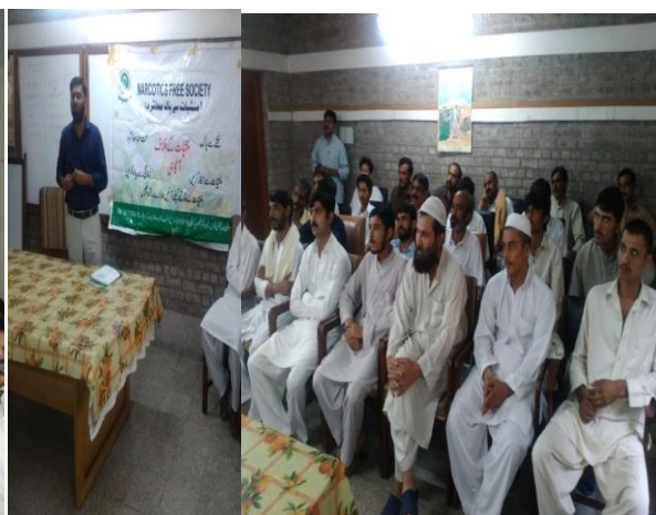
Lecture at Caritas Drug Abuse Treatment Center Peshawar - 4 th June