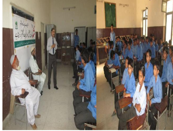
Lecture at Govt. Boys High School Railway Quarter Mughal Pura, Lahore - 6 th June