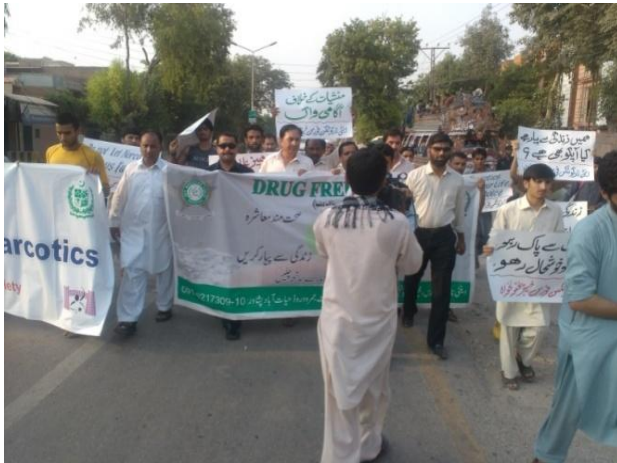
Walk organize at Peshawar - 18 th June