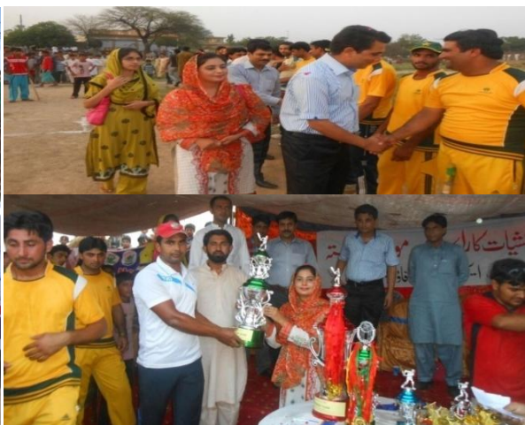
Sports Competition at Sialkot Sprts Complex, Sialkot - 26 th June