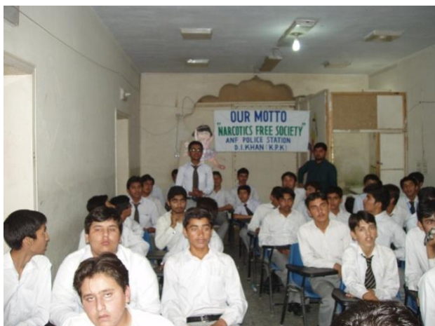
Lecture at The Kanz School and College D.I.Khan - 4 th June