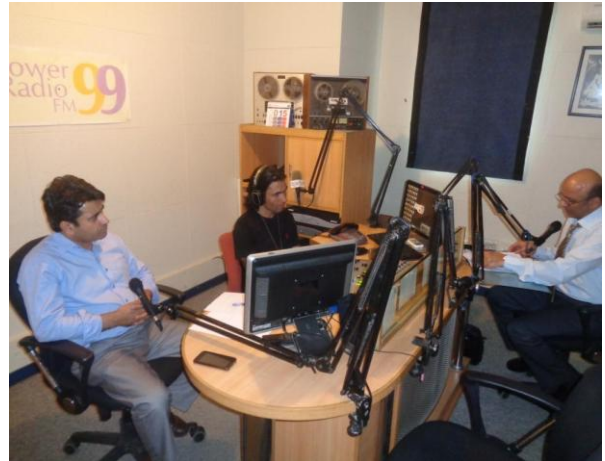
Awareness Through FM 99 - 3 rd June