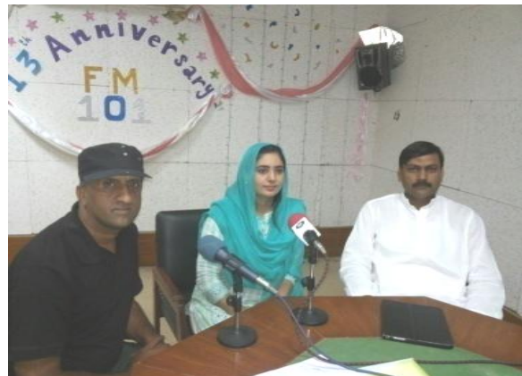
Awareness through FM Radio in Sialkot - 26 th June