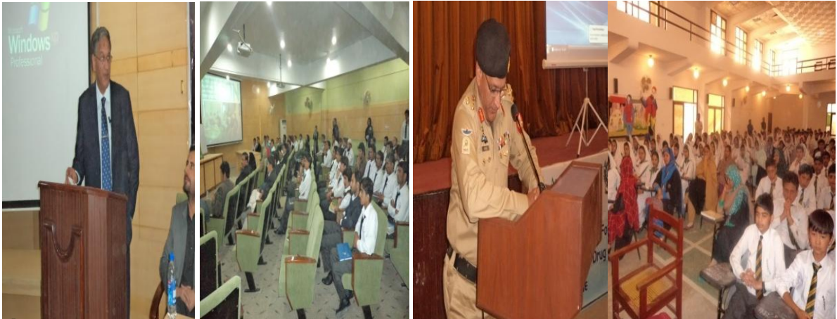
Seminar held at BUITMS Taku Campus, Quetta - 8 th June