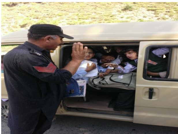
Awareness through Published Material - 8 to 26 th June