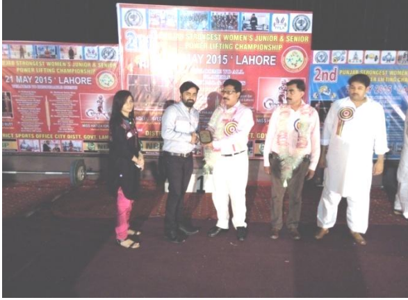
Sports Competition at PAF Cinema, Lahore - 1 st June