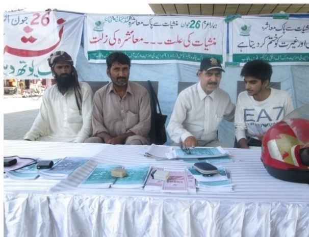
Stall at Mughalpura, Lahore - 25 th June