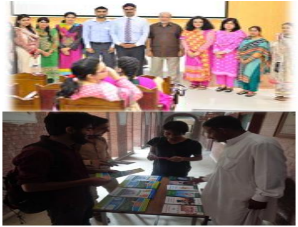
Awareness Stall & Particptation in Seminar at GCU Lahore - 16 th June