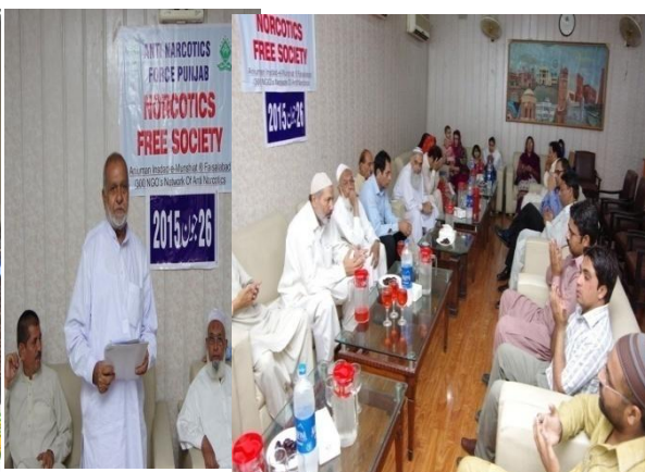
Seminar held at Faisalabad - 26 th June