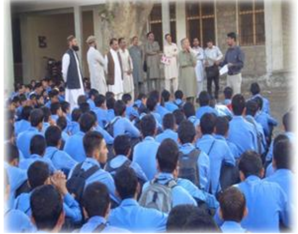
Lecture at Govt Sir Syed Ahmed Khan Boys High School, Gilgit - 25 th June