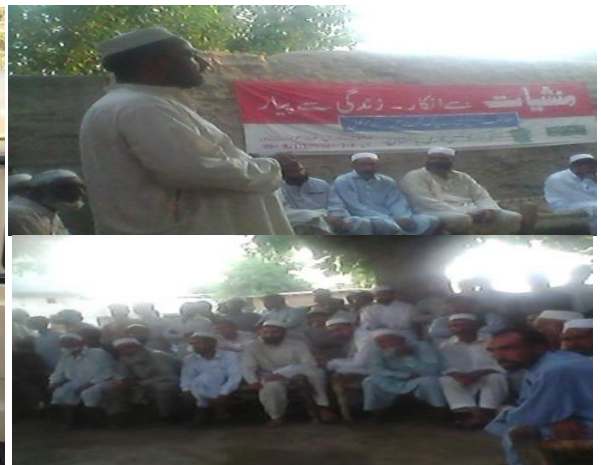
Awareness Session held at Peshawar - 26 th June