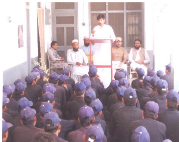
Lecture at Govt Higher Secondary School Kohat - 16 th June