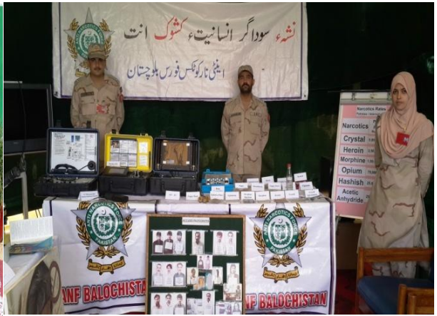
Awareness Stall organize at Govt. Girls Degree College - 20 th June