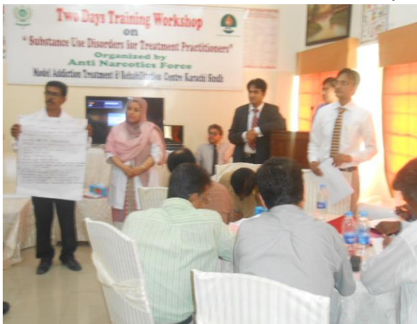
2 - Days Training Workshop organized in MATReC Karachi