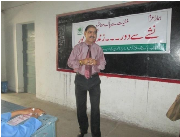
Lecture at Govt. Girls High Sec School, Lahore - 8 th June