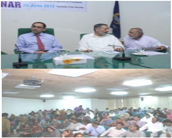
Seminar at Agriculture Uni, Faisalabad - 18 th June