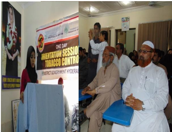
Seminar organized at Auditorium of Shah Bhattai Hospital, Latifabad, Hyderabad - 26 th June