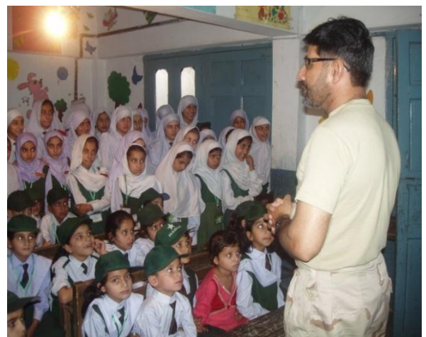
Lecture at Mansehra Capital Public School Mansehra - 25 th June