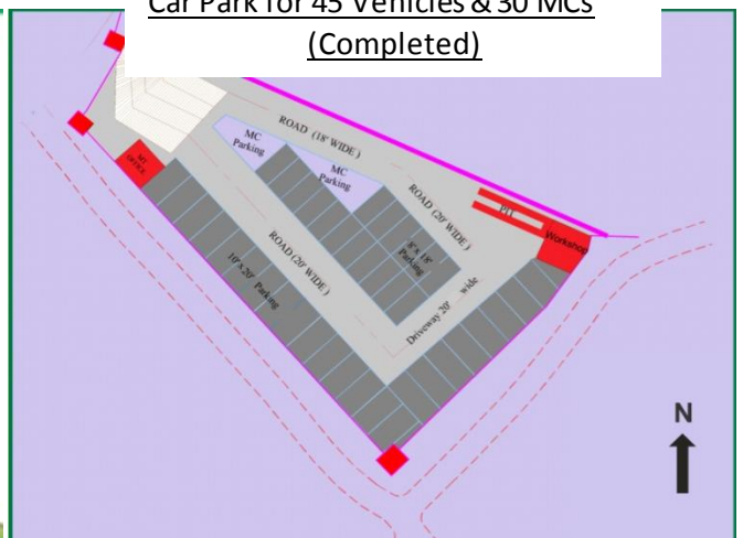
Car Park for 45 Vehicles & 30 MCs (Completed)