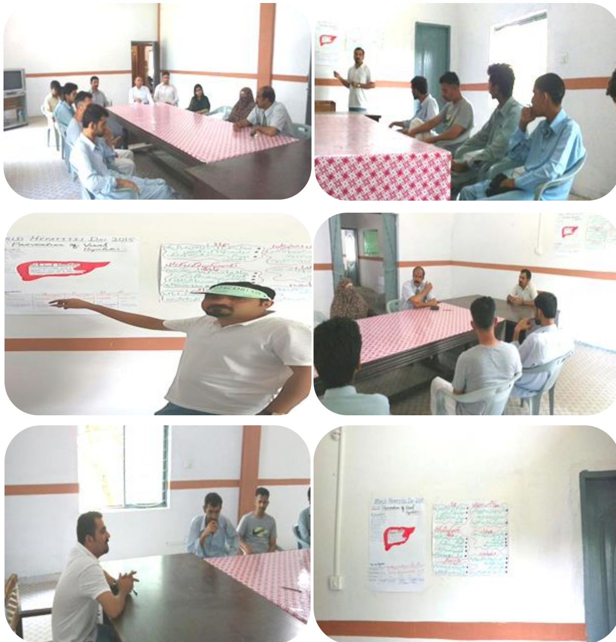
Awareness Session on drugs & its devastating effects, on World Hepatitis Day at MATReC, Islamabad - 28 th July