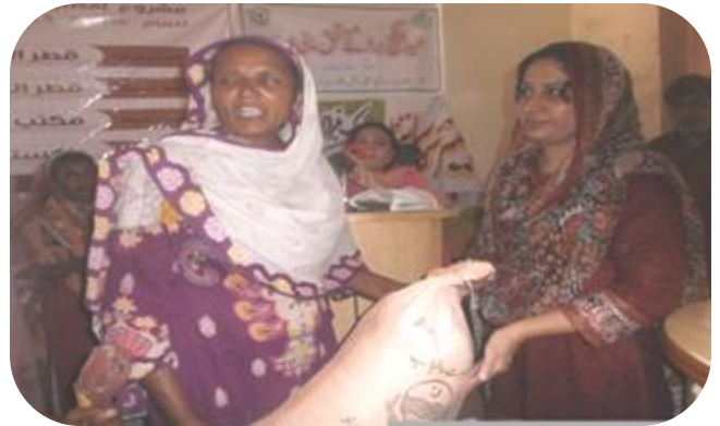
Eid Package at Johar Abad, Khushab - 22 nd July