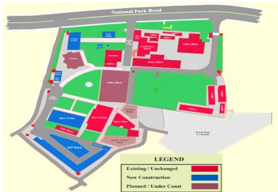
ANF HQ - Master Plan