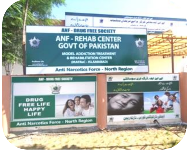
Display - Awareness boards against drug abuse at MATReC Islamabad - 8 th July