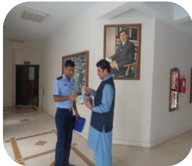
Distribution of Awareness Material at National Police Academy, Islamabad - 26 th -31 st July