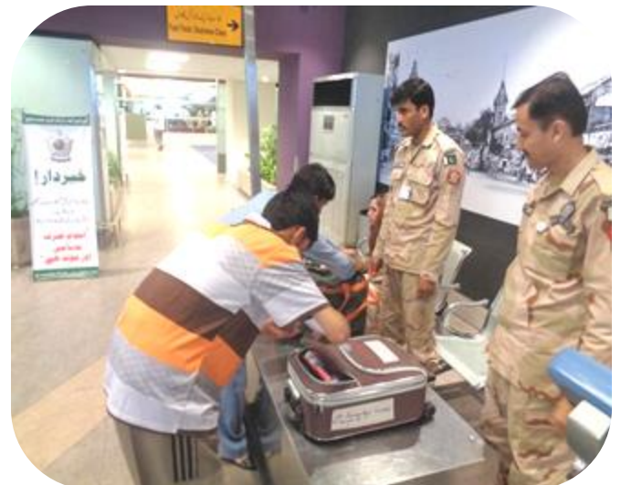
Awareness campaign against drug abuse / drug trafficking at Benazir Bhutto International Airport - 2 nd July