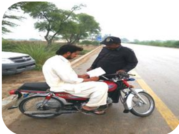
Awareness Campaign at DI Khan, Peshawar Road - 29th July