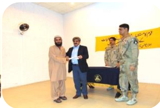
Symposium of Rehabilitated Drug Addicts at Head Quarters Pakistan Coast Guard, Karachi 29 th July