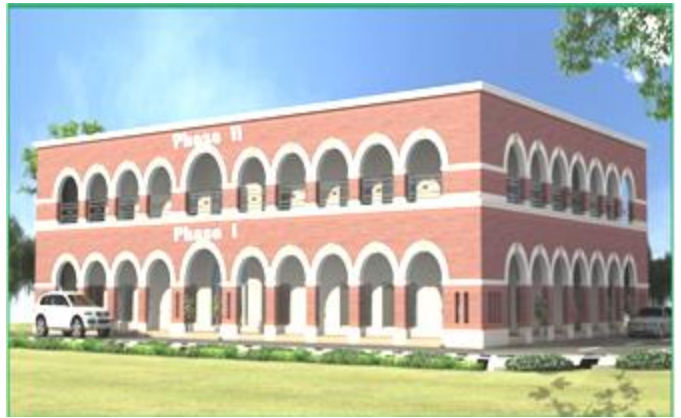
Office Block (Under construction)