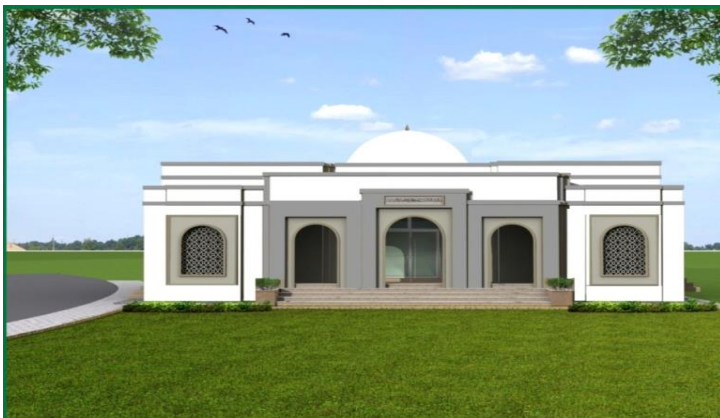
Mosque for 216 persons (Under construction)