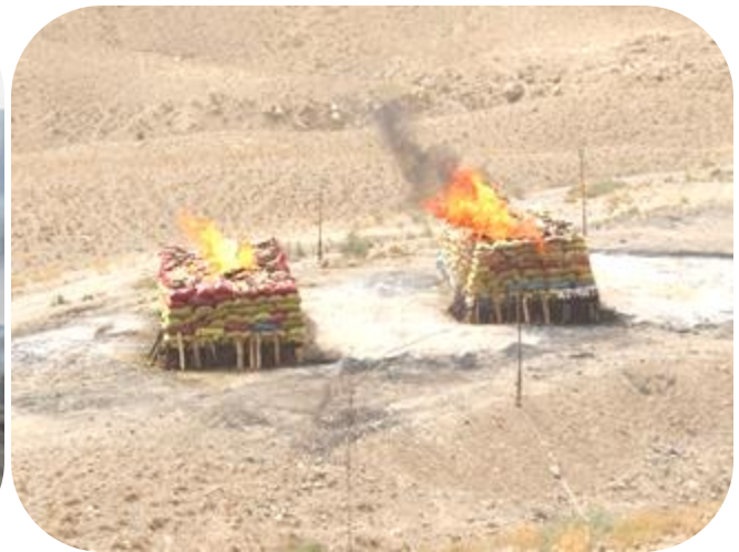
Drug Burning Ceremony at Quetta